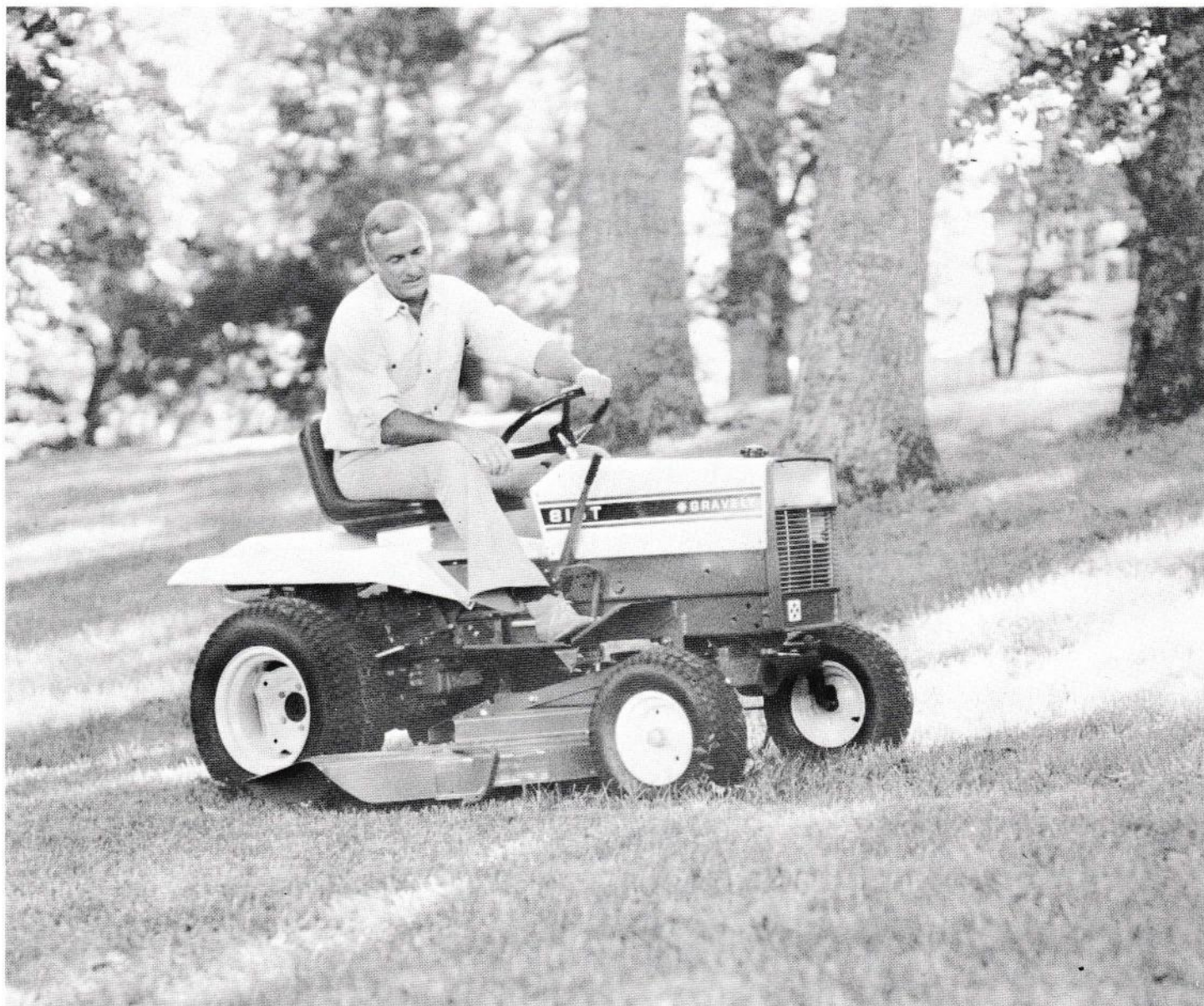
Gravely 818T Tractor with 50" rotary mower attachment.

GRAVELY. 800 SERIES 10, 12, 16, 18 HP. RIDING TRACTORS