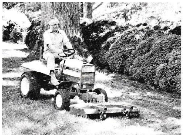
Gravely 816T Riding Tractor with 40" Front Mount Mower attachment, optional Front Drive Kit and Front Mount Kit.