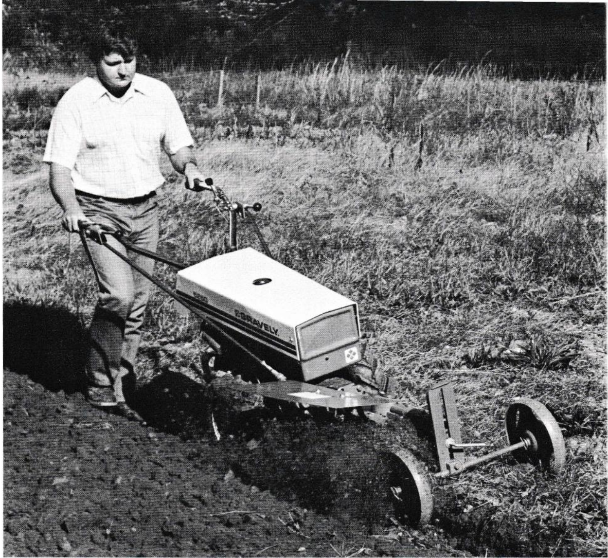
Gravely two-wheel convertible tractor Model 5260 with rotary plow attachment preparing a perfect seed bed in one operation.

GRAVELY. 5000 SERIES 8, 10, 12 HP. TRACTORS TWO, OR FOUR-SPEED — ELECTRIC OR RECOIL START