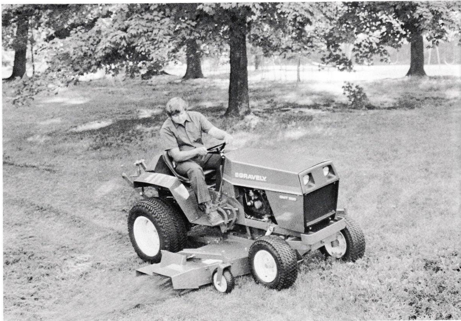
The new Gravelly GMT 900, shown with optional category 1, 3-point hitch, 72" rotary mower attachment.