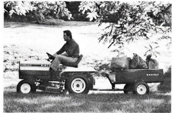
Gravely 818T Riding Tractor with hauling cart and 50" Rotary Mower attachments.

Enjoy a comfortable, stable ride because you have full-length foot rests, a padded seat and a tractor designed with a low center of gravity.