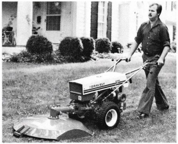
Gravelly two-wheel convertible tractor, Model 5260, with new 30" rotary mower attachment for lawn and rough.

Because Gravelly attachments — like Gravelly tractors — are built to last for a long, long time.