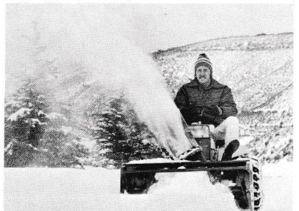
818T Gravely Riding Tractor with 44" Snowblower attachment with optional tire chains, wheel weights.