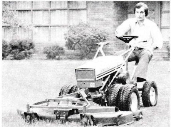
Gravelly two-wheel convertible tractor, Model 5460, with 50" rotary mower attachment, optional steering sulky and required optional dual wheels, front mount kit and quick hitch pin kit.

PLEASE ASK FOR A FREE DEMONSTRATION. YOU WON'T WANT TO REPLACE IT. YOU PROBABLY WON'T HAVE TO.