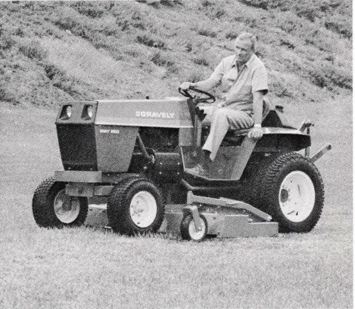
New 26 hp. Gravely GMT 900 with 72" rotary mower attachment.